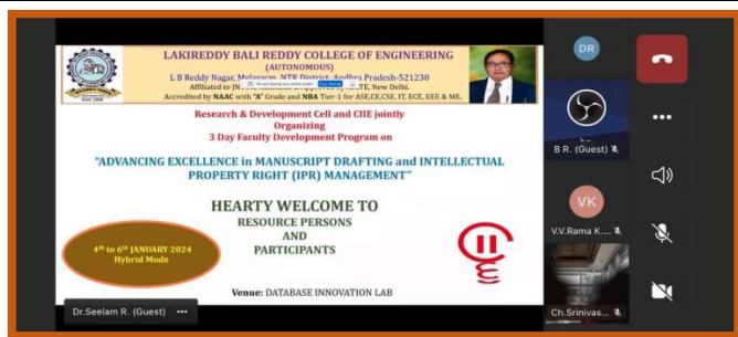
Fig: Inaugural Session