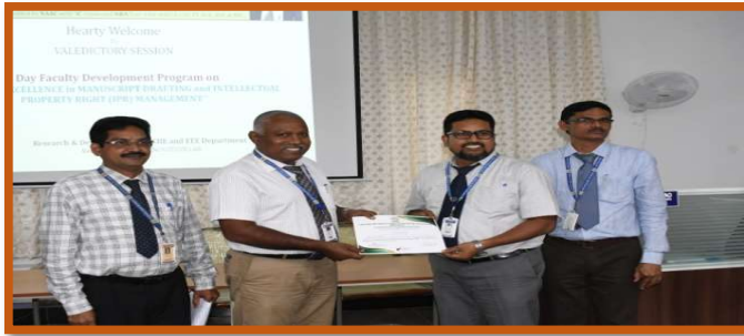
Fig. Certificate Distribution to Participants