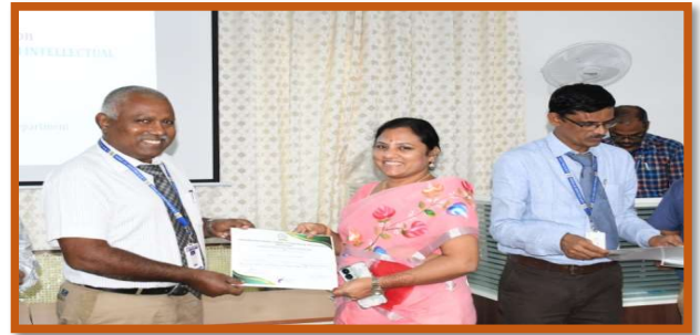
Fig. Certificate Distribution to Participants